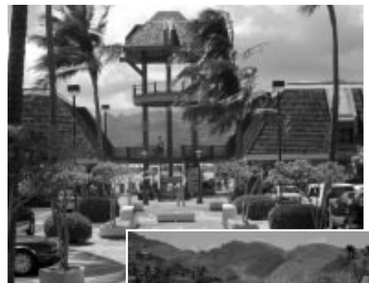
Akal Officer on duty at the Koko Marina Shopping Center bell tower