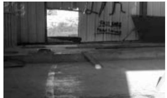
Photo depicts tire marks across floor through hole in wall