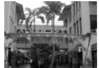
Aloha Tower Marketplace located adjacent to Honolulu Harbor