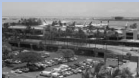
Akal Security provides security services for Honolulu International Airport