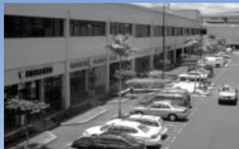
Airport Trade Center in which Akal provides security services consists of restaurants, retail businesses, parking center for travelers and business offices.