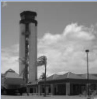
Federal Aviation Administration Complex in Honolulu, Hawaii, in which Akal provides security services

Akal provides security services for the Honolulu International Airport, the Airport Trade Center and the Federal Aviation Administration Complex