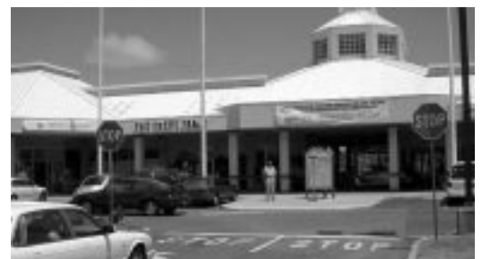
Akal Security Officer at the Hawaii Kai Towne Center