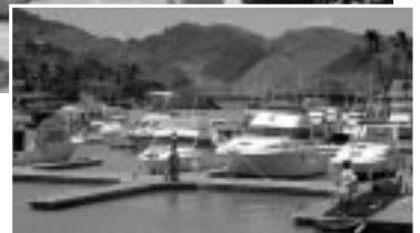
Marina which moors over 100 boats at the Koko Marina Shopping Center