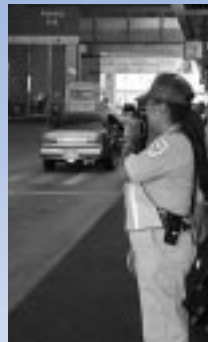
Akal Guard conducting traffic control at Honolulu International Airport