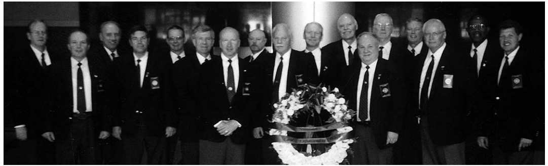
Minneapolis Court Security Officers